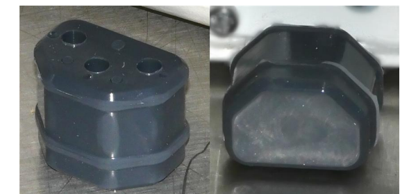
PN 10736 Rubber plug to block unused AC power receptacle.

Power supplies are subject to substitution without notice due to availability issues and changes in regulations.