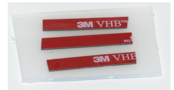
Tape to secure wires.