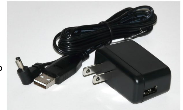
PN 10733 Power Supply - XP Power 5V 1A and PN 10734 Cable Assy 1.35mm ID x 3.5mm OD RA plug to USB A, 6 foot.

The illuminator may be powered by plugging the cable into the power supply provided, or into a suitable USB port on a computer or other device.